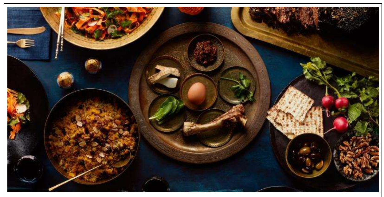
Enjoy JIMENA's curated collection of Pesach recipes and resources, by <u>clicking here</u>.